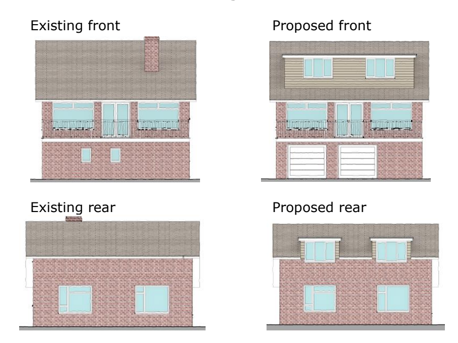
Fig 1: 'La Torre' elevation drawings

Secondly, construction of a detached 3 bedroom two storey dwelling on existing garden land to the side of 'La Torre'. Internally the ground and first floors of the proposed house are split level to account for the changes in external ground levels.