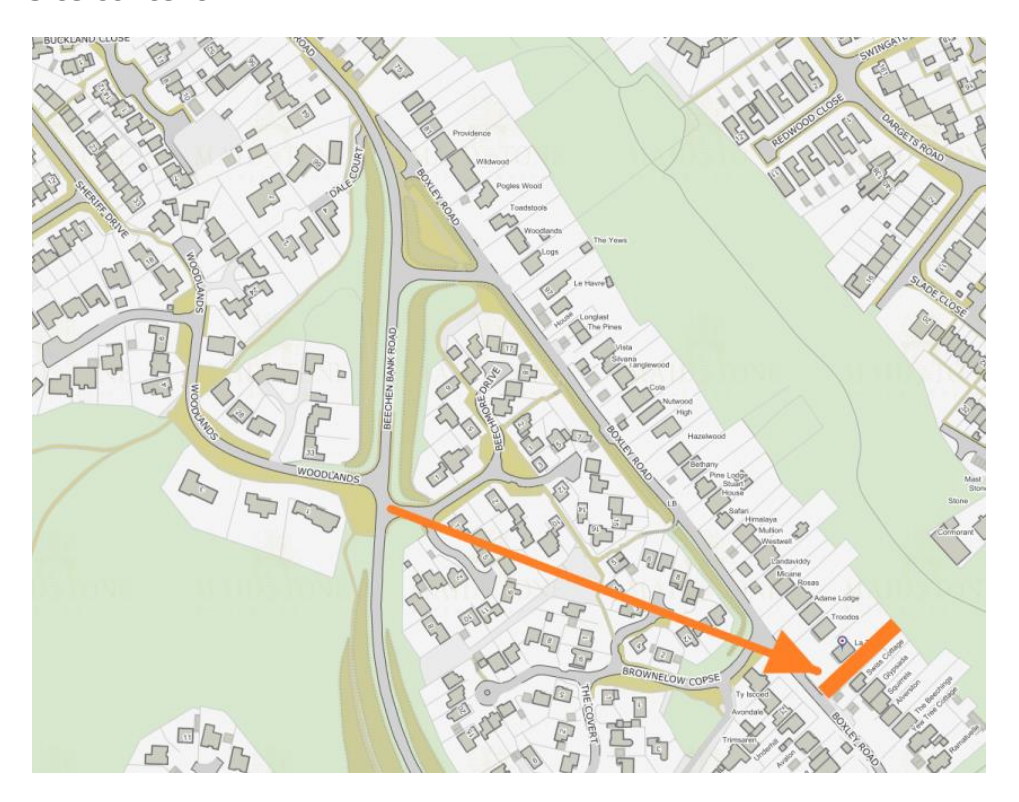
Fig 3: Site context