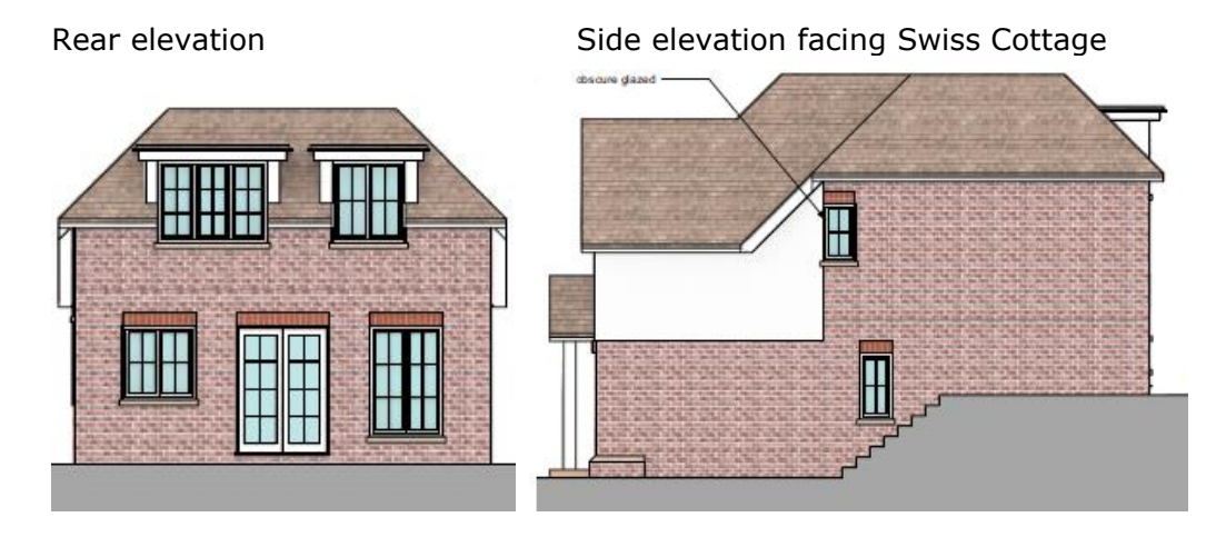
Fig 5: Proposed new build dwelling rear and side elevations.