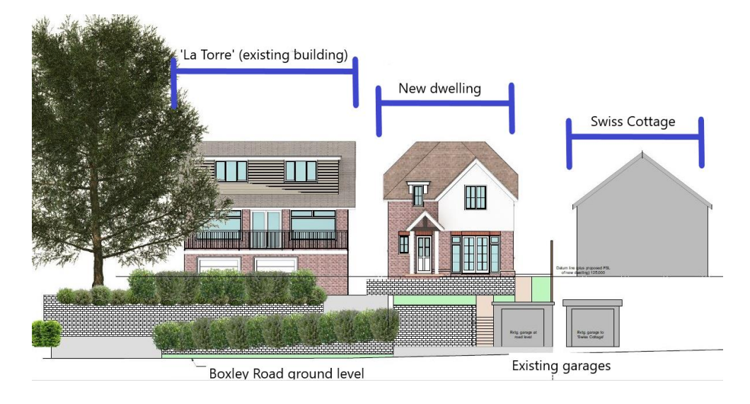
Fig 2: Street scene drawing - proposed.

Secondly, construction of a detached 3 bedroom two storey dwelling on existing garden land to the side of 'La Torre'. Internally the ground and first floors of the proposed house are split level to account for the changes in external ground levels.